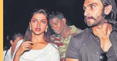
Deepika and Ranveer are reportedly spending lots of time together. Top: At the nightclub

What you see in the picture above is either a clever marketing ploy, or some serious sparks flying. The new 'it' couple in Bollywood, Deepika Padukone and Ranveer Singh, having been sharing as much of an intimate chemistry off-screen as they do on screen, in their upcoming Sanjay Leela Bhansali film, Rameela. The two, who otherwise maintain the 'just good friends' status, flew to Dubai to enjoy each other's company at a nightclub where they danced through wee hours. And, a close, cuddly picture of the actors from their revelry has gone viral, making tongues wag. Many say the two took off to Dubai for some private time to avoid paparazzi. Deepika was there to promote Race 2, while Ranveer decided to accompany her. When Padukone was quizzed about her equation with Ranveer at a press meet in Dubai, she said, "I don't understand this fascination people have with my personal life. I am single."